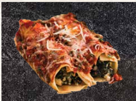
Spinach & Fetta Canneloni

Veggies / Wedges / Sweet Potato Fries / Potato Mash / Garden Salad / Caesar Salad / Cheesy Fries / Cheesy Wedges