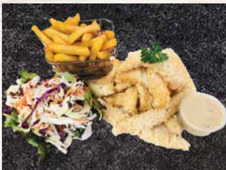
Salt & Pepper Calamari