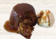
Sticky Date Pudding