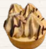
Salted Caramel Cheesecake