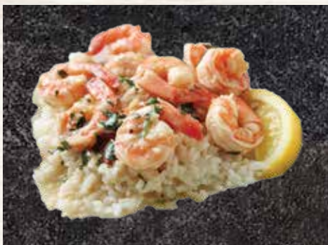
Garlic Prawns Main