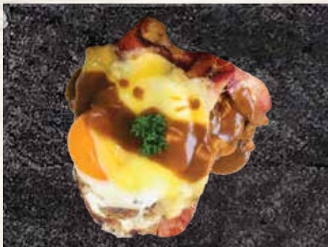
Aussie Outback Parmy