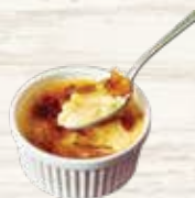
Coffee Crème Brûlée